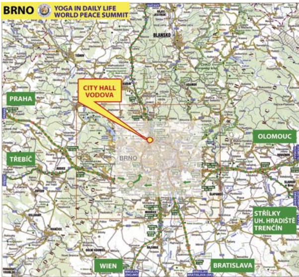
Map No. 1: BRNO - surrounding