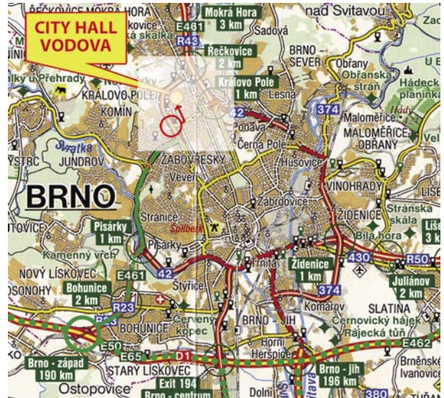
Map No. 2: BRNO